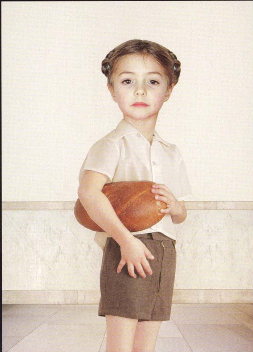
Girl with a Loaf of Bread, 2001. ©Loretta Lux

THE ART AND CRAFT OF PHOTOGRAPHY IN THE 21ST CENTURY