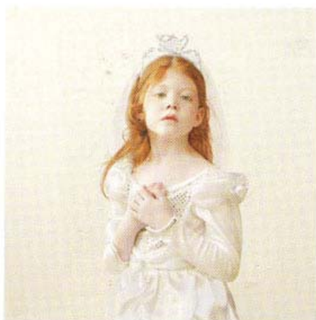
The Bride, 2003